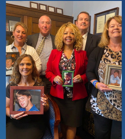
Parents with Senator Amy Klobuchar (D-MN) (top left); Representative Alan S. Lowenthal (D-CA) (bottom left); and Representative Lucy McBath (D-GA) (right).